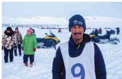
ስፔሪንግ ስፔሪንግ NANURAQ UTTAK ገረገሪ • IGLOOLIK