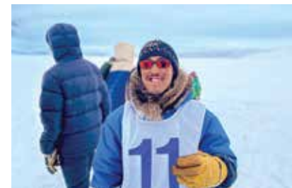
ስፔሪንግ APAK ገረገሪ • ARCTIC BAY