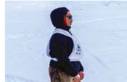
የረገሪ ስፔሪንግ QILIQTI IVALU ገረገሪ • IGLOOLIK